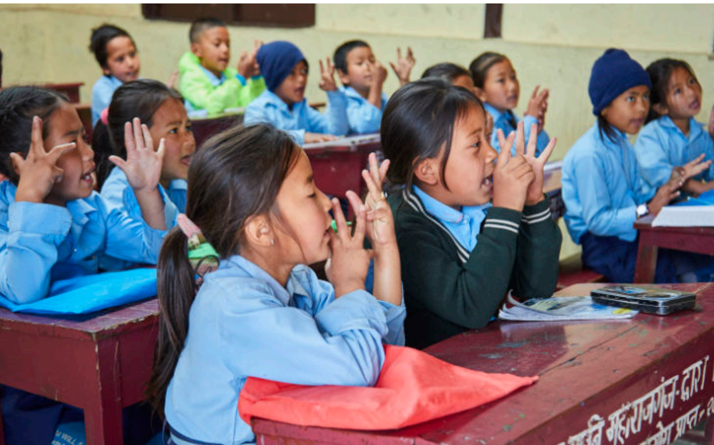
Tarebhir Basic School students in a maths lesson