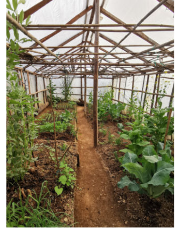
The vegetables on the farms are thriving

The women thus independently address the problem of malnutrition by growing a variety of vegetables. They also generate their own income, which positively changes their position in the family and in the community. Perhaps the most important consequence, however, is self-reliance and empowerment, which gives the women a new sense of self-confidence and strengthens their belief in their own abilities.