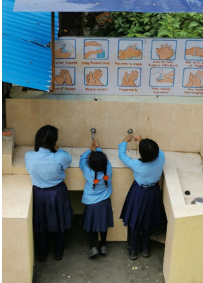
A washing station was built at Tarebhir Basic School to enable the children to wash their hands effectively