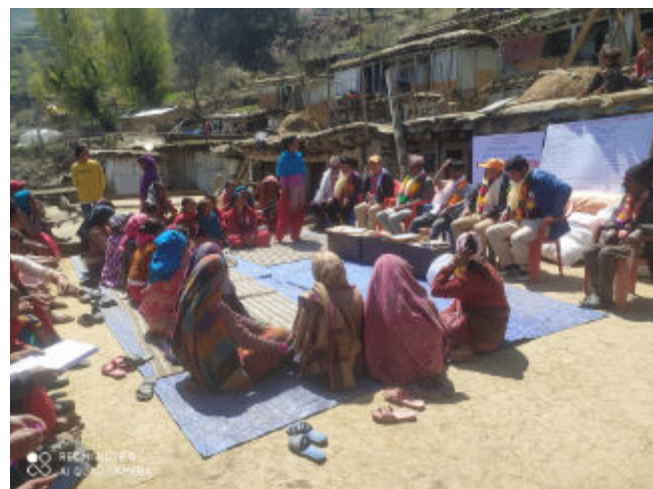
Community level awareness campaign on safe drinking water

In Nepal, only 27% of the population has access to safe drinking water. While some parts of the country struggle with water scarcity, other parts suffer from extensive flooding, regularly destroying local infrastructure. 62% have access to basic sanitation facilities, the overall access to improved, safe sanitation, however, remains low. Without these basic needs, Nepal's children are at a high risk of water- and sanitation-related diseases. According to the Department of Health Service in Nepal, 3,500 children die each year due to water-borne diseases.