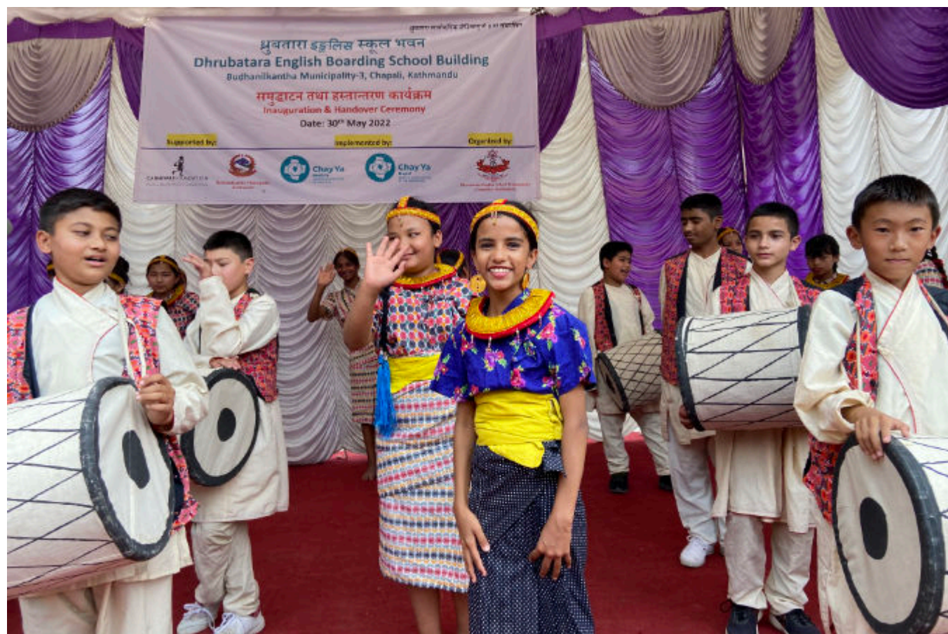
Inauguration ceremony at Dhrubatara Secondary School in May 2022