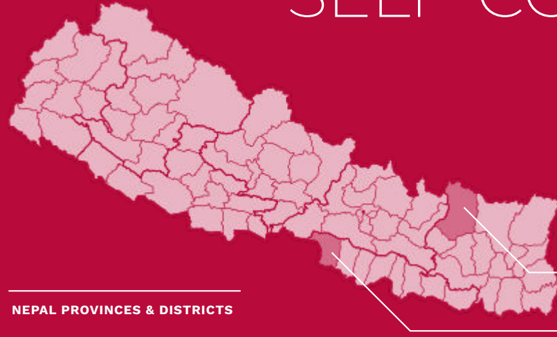
NEPAL PROVINCES & DISTRICTS