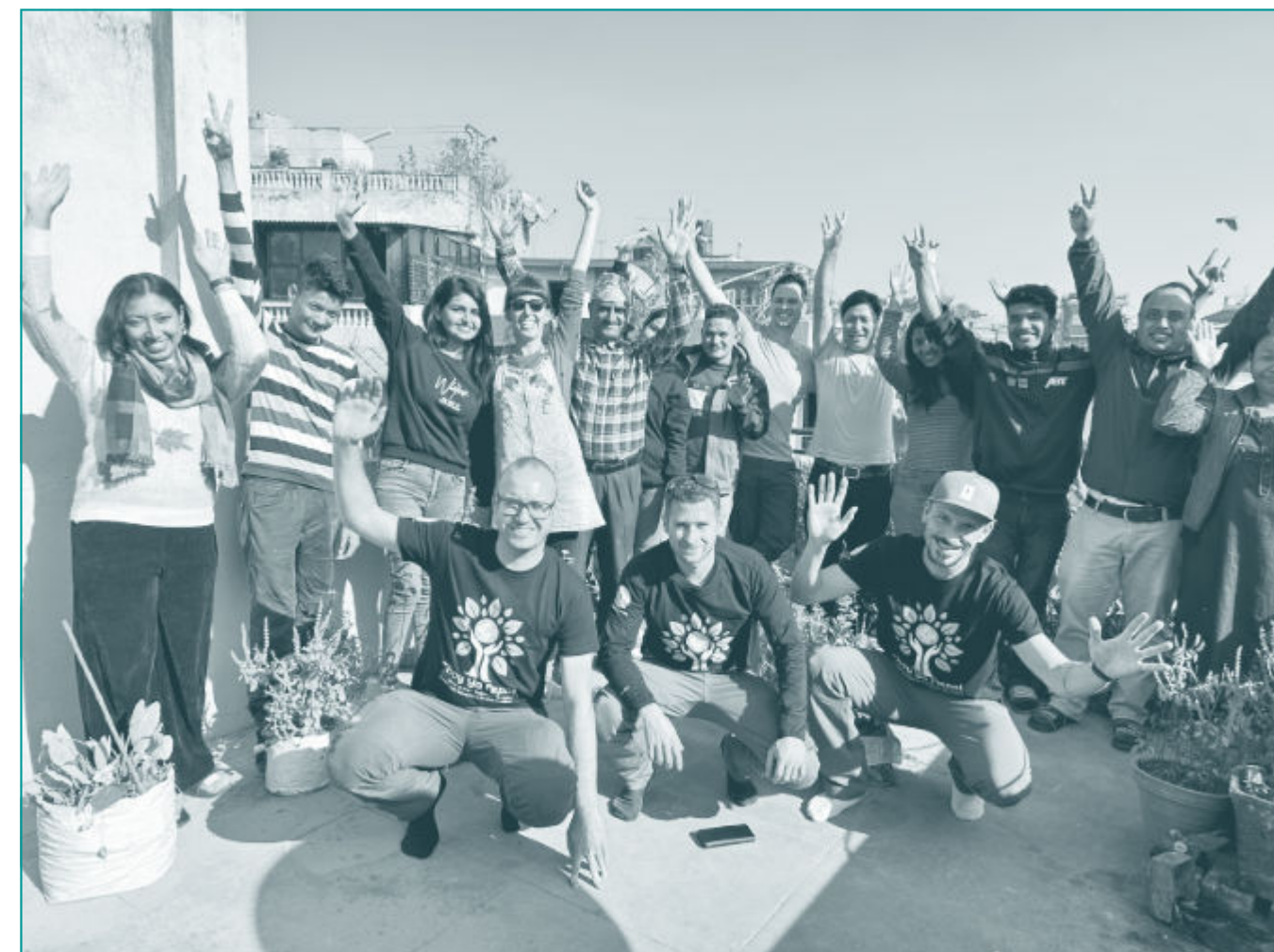
Our team in Kathmandu

It has been one of the most wonderful experiences of my life to be a part of the CYN family. My admiration for CYN has always been based on its mission to offer high-quality healthcare and education in the Himalayas. I will continue to contribute to CYN by participating in various projects and offering my best effort. A key lesson I've learned during my engagement with CYN is how to work as a team rather than as an individual. I wish to learn and contribute more to health and education sectors under the guidance of CYN.