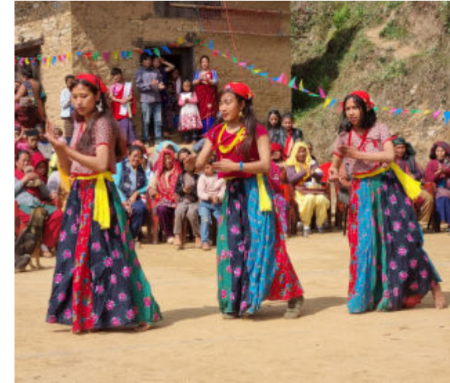
A warm welcome for our team at the organic model farm in Ghunsa

Women and girls usually have a low status in Nepal's patriarchal, religious society. Their task is child care and the household. Financial and family authority rests with male family members.