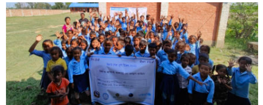
Awareness campaign on World Handwashing Day