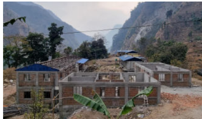
Dharche Community Health Center in Gorkha

Currently, we are in the process of building our biggest health project yet: the Dharche Community Health Center in Gorkha, in support of the Rural Municipality and Earth C-Air. More than 20,000 people from 2 remote municipalities are to benefit from this institution in the future! There will be beds for patients, specialists such as dentists, a lab, a pharmacy with medicine and x-rays. Staff training will be offered as well as the use of telemedicine to be able to reach even more patients and offer them the best care possible. Construction should be completed in 2023.