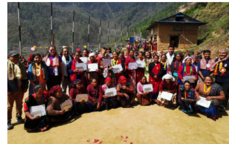
25 women have already received an official certificate for organic farming