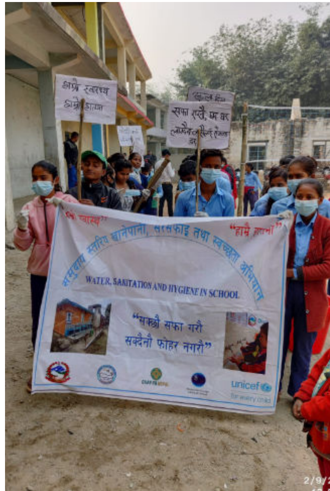
Awareness campaign for students on WASH in schools