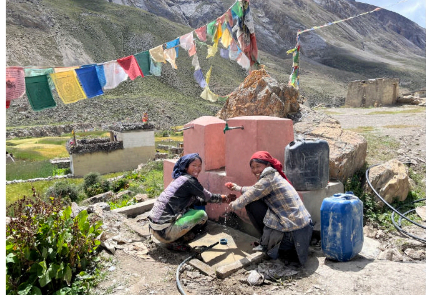
The villagers are enjoying the clean drinking water at their door step